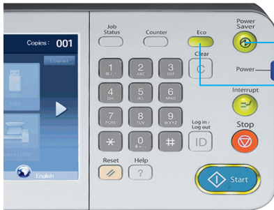
Power Save Button

Samsung is the fastest-growing printer manufacturer, and number two printer company worldwide. Our innovations and designs have been recognized with more than 100 awards for performance, reliability and eco-friendliness. Like all Samsung products, the Samsung SCX-8030ND/SCX-8040ND MFPs are engineered with minimal impact on our planet in mind.